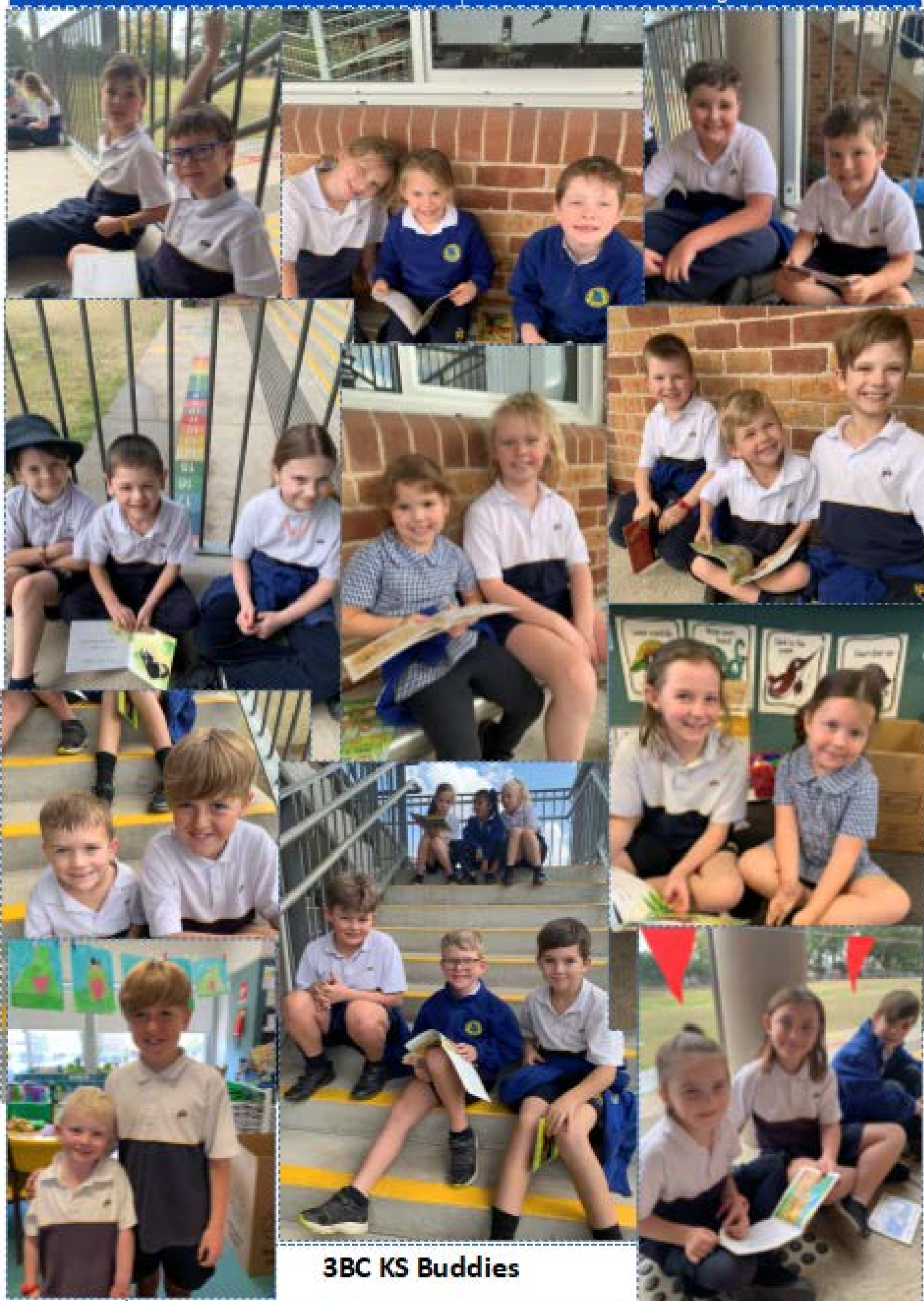
3BC KS Buddies