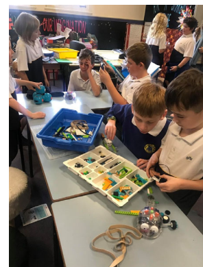
Buddies K/10L and 4/5B

P&C AGM Meeting tonight at 6.00 pm in the Library followed by general meeting at 6.30 pm All welcome.