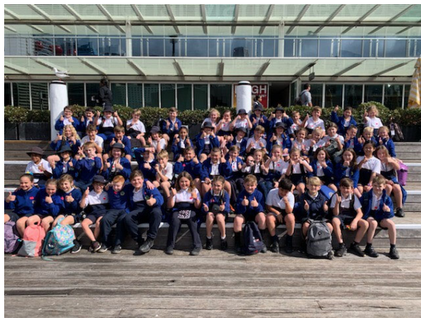
Year 4 Sydney

The Week 6 assembly will be hosted by 1G at the starting time of 12.45 pm.