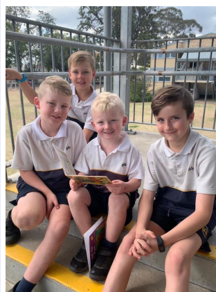
Buddies 3BC and KS