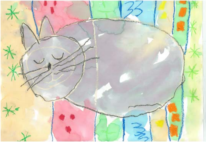
Created by Lara