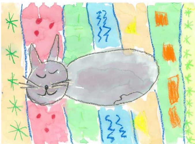
Created by Olivia