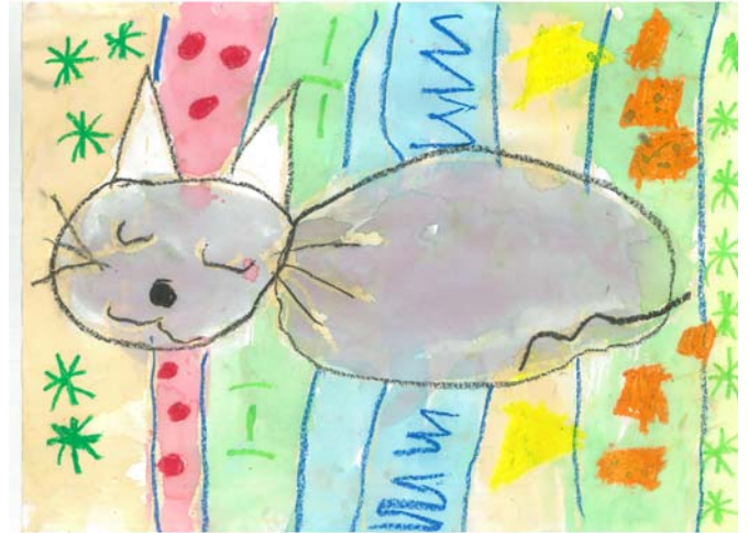
Created by Mila