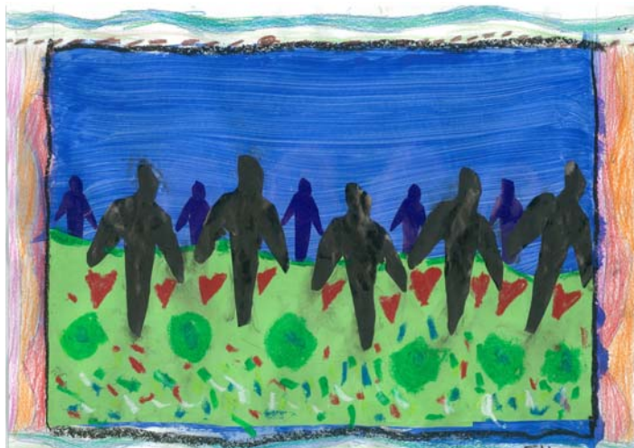
Created by Ella