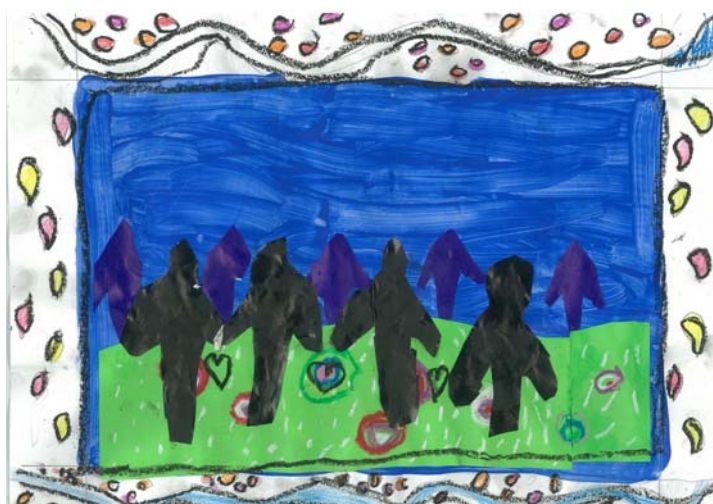
Created by Laila