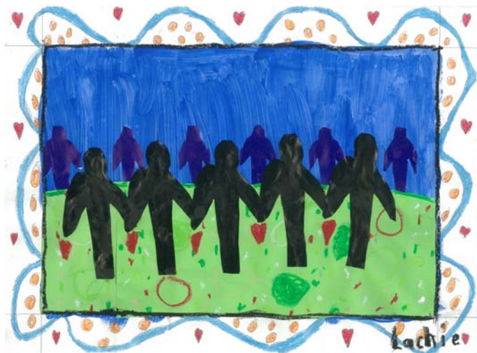
Created by Lachie