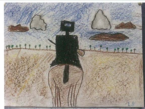
Work by: Elyse