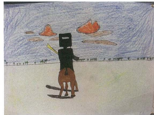
Work by: Emilia