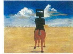
Original work by Sir Sidney Nolan

In 5I we have been examining some of Australia's pioneering artists. We have been studying the works of Albert Namatjira and Sir Sidney Nolan. Students examined the famous interpretation of Ned Kelly by Sir Sidney Nolan and we discussed the "block-like" and impressionist style used by the artists. All students examined proportion and spacing as part of their art as well as the detail and colour used. Well done everyone.