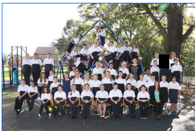
Good luck Year 6 on your future educational journey.